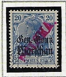
20f Prussian blue Polish overprt red.