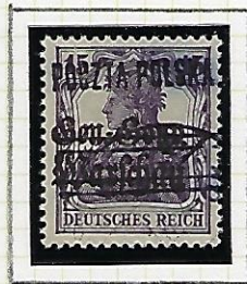
15 f slate-violet