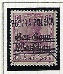
60 f magenta (purple lilac)