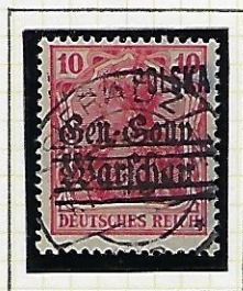
10 f rose-red (German overprint sulphureous)