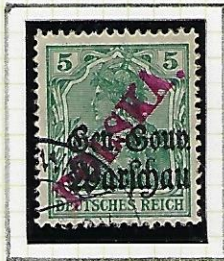
5f green Polish overprt red.