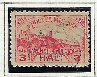
3h red & yellowish