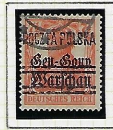
7 1/2 f orange