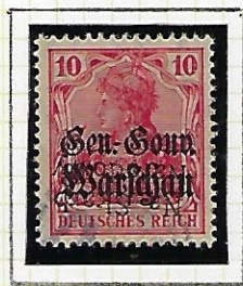
10 pf carmine