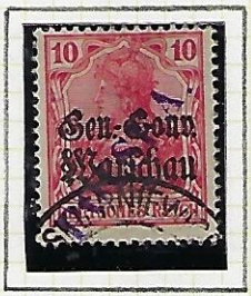
10 f carmine Polish overprt violet