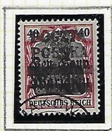
40f black and carmine