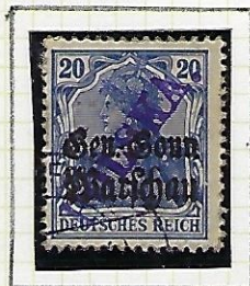
20f ultramarine (German overprt. shiny) Polish overprt violet.