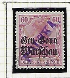
60f bright lilac (German overprt. sulphureous) Polish overprt violet.