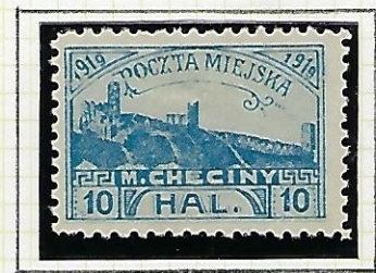
10h blue and pale bright blue