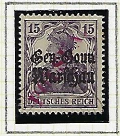
15 f slate-violet Polish overprt red