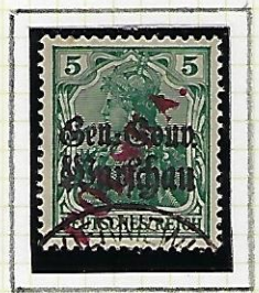
5 f green Polish overprt red