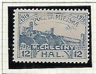
12h grey, and pale brownish rose (the rose component, if any, seems absent).