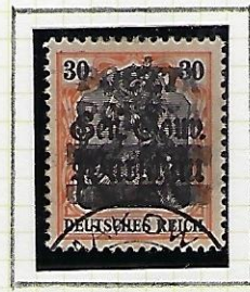
30f black and orange/buff