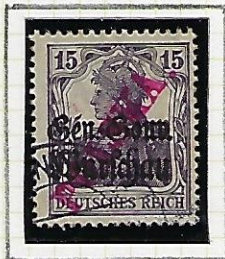
15f slate-violet Polish overprt red.