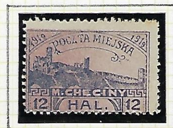
12h grey lilac and pale brownish rose