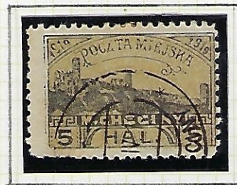
5h black-sandstone & sandstone