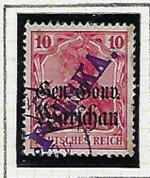
10f carmine Polish overprt black.