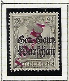
2 1/2 f grey Polish overprt red

Known as " SKIERNIEWICE II ". Thinner overprint, with pointed tip of "A" . Hand-stamped with rubber stamp , in red or violet . Unofficial but accepted by Post.