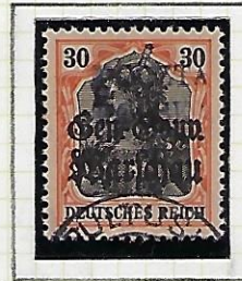
30f black and orange/buff