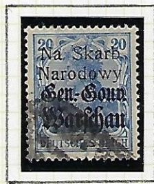
20f pale blue