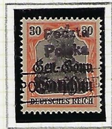
30f orange and black