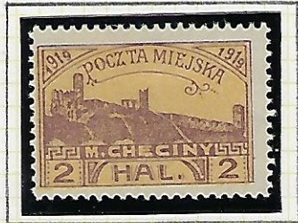
2h brown & yellow