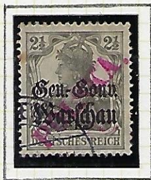
2½f grey Polish overprt red.

Known as " SKIERNIEWICE I ". Thick overprint , handstamped in black, red, or violet. Not official , but tolerated.