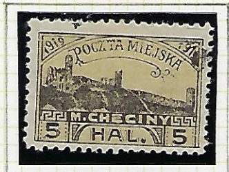
5h black & sandstone darker colours