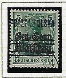
5 f green