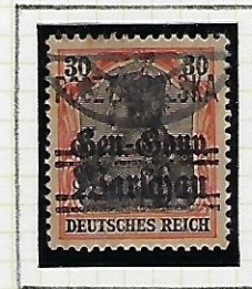
30 f black and orange/ buff