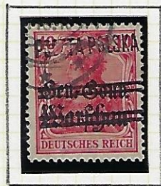
10 f carmine