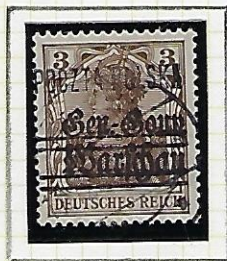
3 f brown