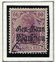
60 f magenta Polish overprt violet