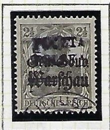
2 1/2f grey

Overprints handstamped in black-violet of brown-black. Official.