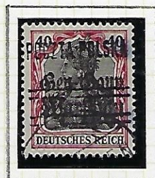
40 f black and carmine