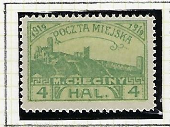
4h green & yellow-green