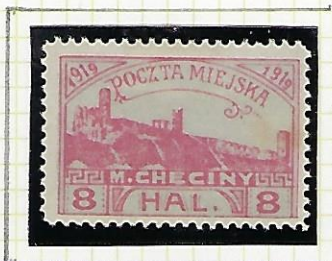
8h red-brown, and pale red without brown and pale blue