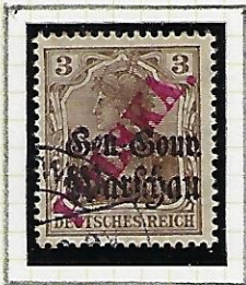
3f brown Polish overprt red.