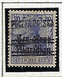
20 f violet-blue (German overprnt mat, dull)