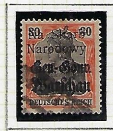
30f black and orange/buff