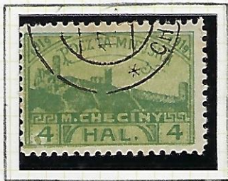
4h green & yellow-green.