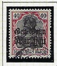
40f black and carmine