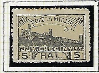
5h black-sandstone & sandstone