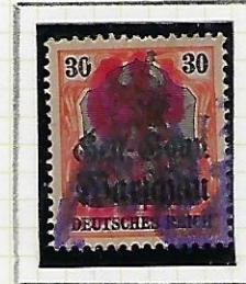
30f orange and black