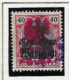
40f black and carmine