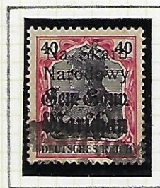
40f black and carmine