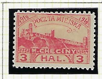
5h red, and pale brown