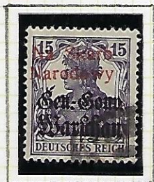
15f blackish viol. Polish overprt in red.