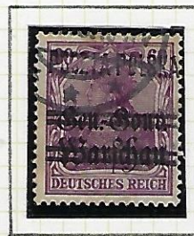
60 f darkish lilac (German overprint mat, dull)