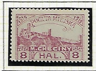
8h red-brown, and pale bright blue