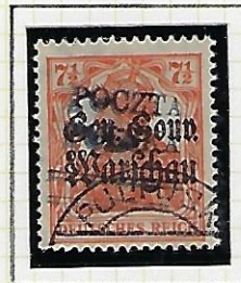
7 1/2f orange