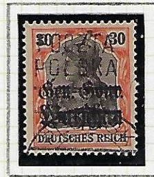
30f orange and black