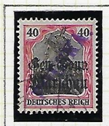
40f carmine and black Polish overprt violet.