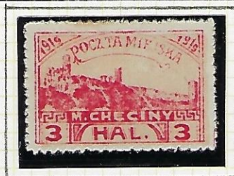
3h red & yellowish