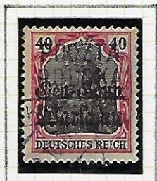
40f black and carmine