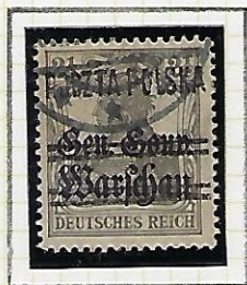
2 1/2 f grey

Overprints (manually applied rubber stamp) in black (Official) , or violet (Un-official) . The variety shown hereunder is the official one.