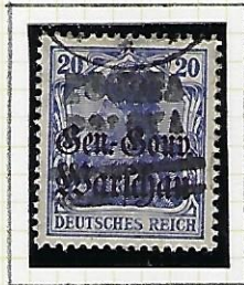
20f Prussian blue