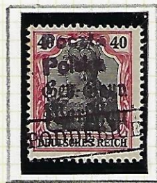
40f black and carmine