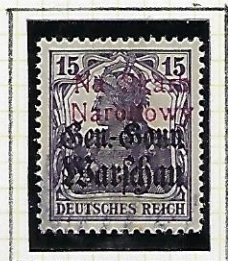
15f dull violet Polish overprt in red.