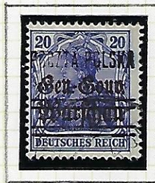
20 f ultramarine (German overprint shiny)