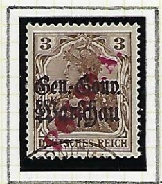
3 f brown Polish overprt red