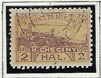
2h brown & yellow