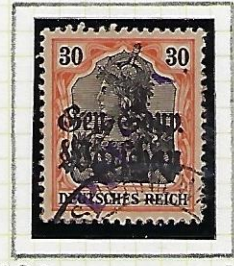
30 f orange and black Polish overprt violet