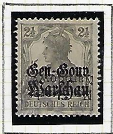
2 1/2 pf grey