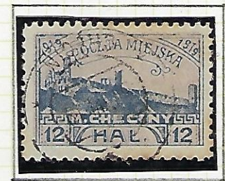
12h grey lilac and pale brownish rose

Quantities: unknown. None of these stamps could have been genuinely postally used. Worth collecting? Perhaps.