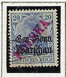
20f pale blue (German overprt sulphureous) Polish overprt red.