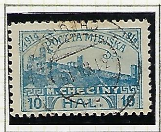
10h blue and pale bright blue