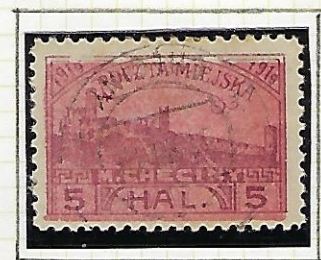
5h red-brown, and pale rose