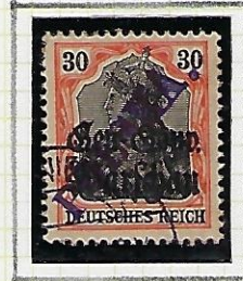
30f orange and black Polish overprt black.