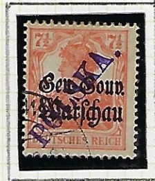
7½f orange Polish overprt violet.