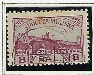
8h red-brown, and pale bright blue.