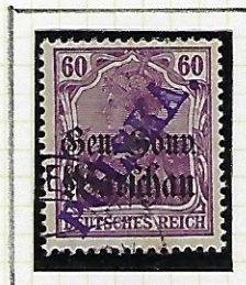
60f purple lilac Polish overprt violet.