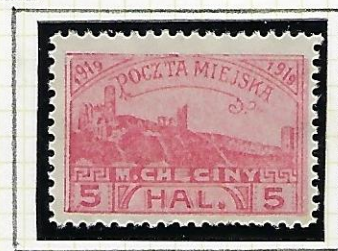
5h red-brown, and pale brown