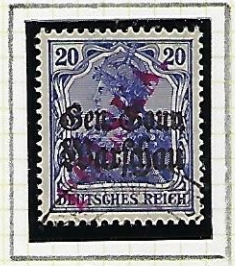
20 f ultramarine Polish overprt red