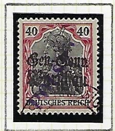
40 f carmine and black. Polish overprt violet