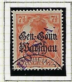
7 1/2 f orange Polish overprt violet